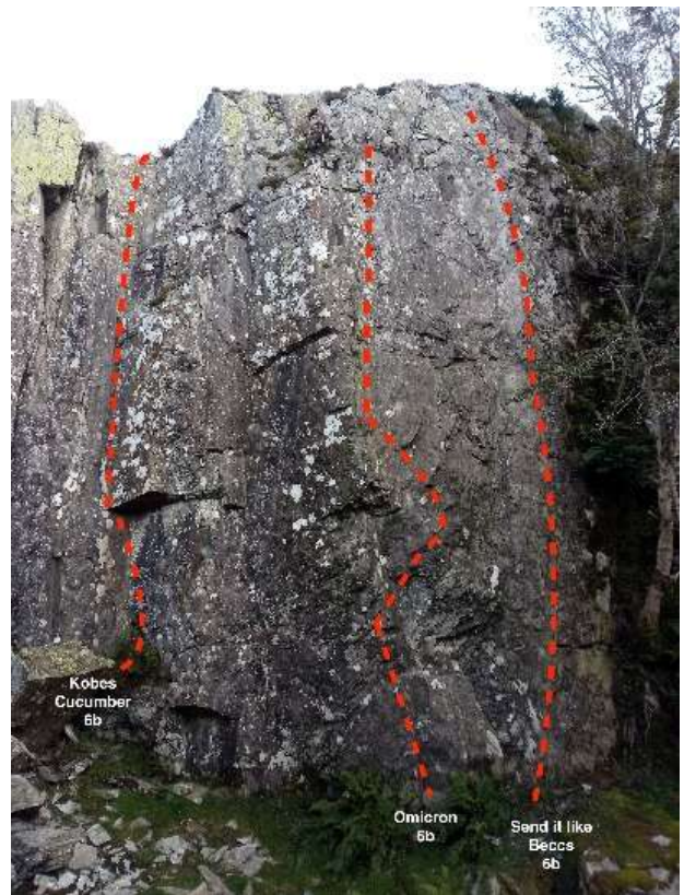
Kobes Cucumber, Omicron and Send it like Beccs.