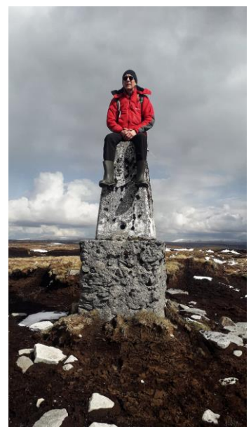
26 Darnbrook Fell