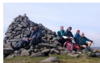
1 Mickle Fell