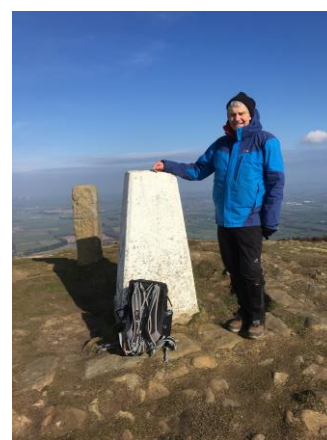
92 Carlton Moor