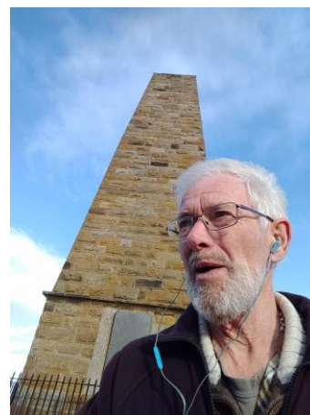
105 Eastby Moor