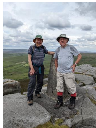
79 Simons Seat