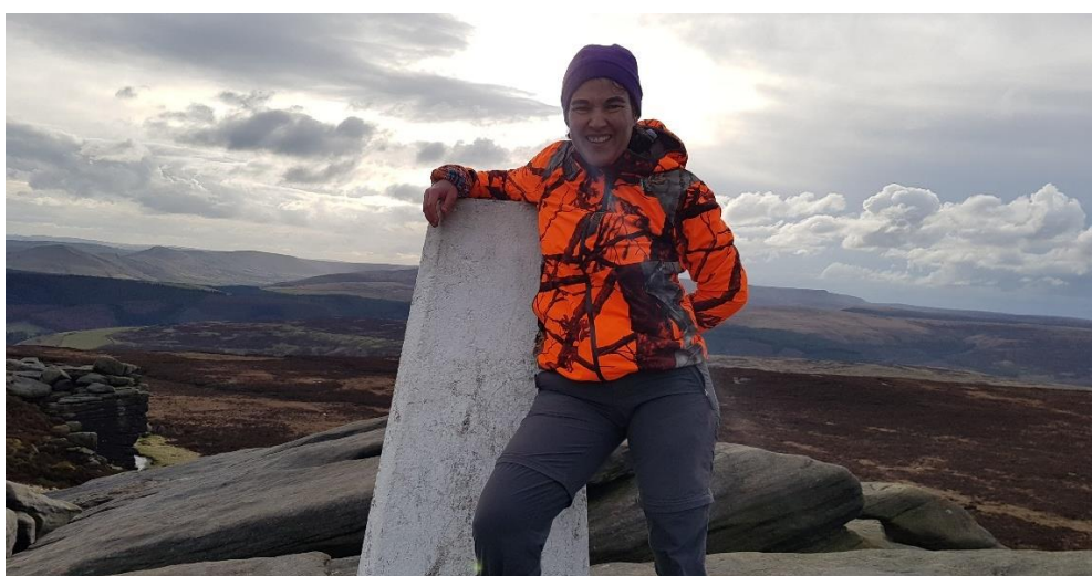
59 Back Tor (above Derwent Dam) with backpacker