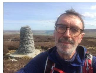
56 Blea Barf