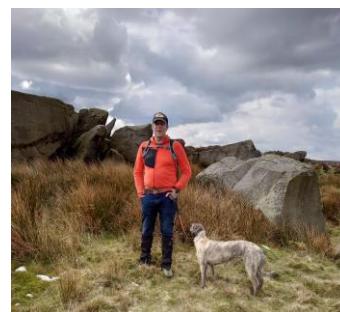
103 Burley Moor