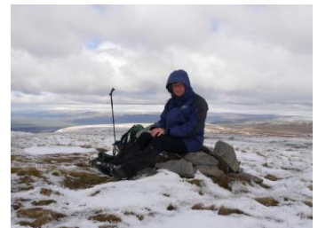
5 High Seat