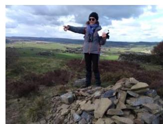
100 Hartcliff Hill