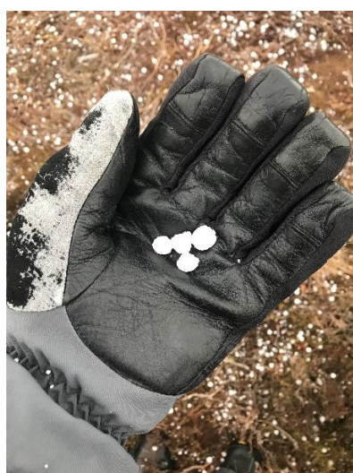
46 Tarn Seat with hail stones