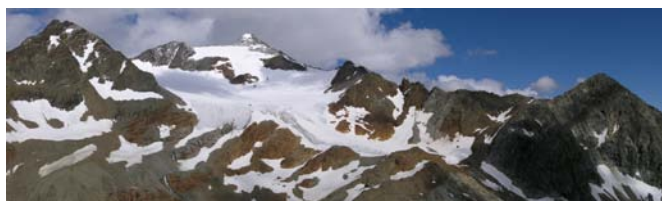
Pfaffenschneid from Hildesheimer Hütte,