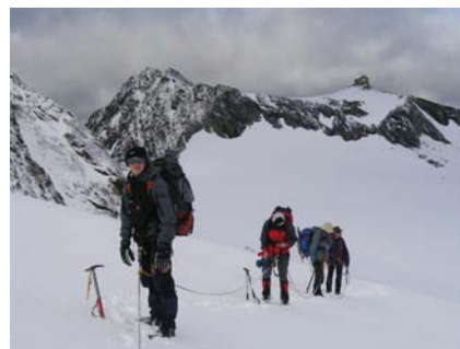
Crossing the Wüttenkarferner below the Hochstubaihütte